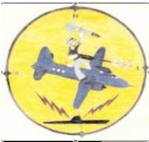
This insignia is the more formal design of Popeye and the P2V.