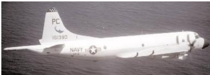
A VP-6 P-3B(Mod) at NAS Barbers Point in April 1979.

Jun–Sep 1988: VP-6 was placed in “Cold Iron” status due to fiscal constraints. Basically, the standdown permitted only the bare minimum of maintenance required to preserve the aircraft, but did not allow for sufficient flying time to retain top crew proficiency. As a result of the standdown aircrew proficiency was graded unsatisfactory on the COMNAVAIRPAC Naval Aviation Training and Procedures Standardization (NATOPS) inspection conducted 26–30 September 1988.